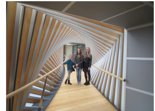
Bridge of Aspiration