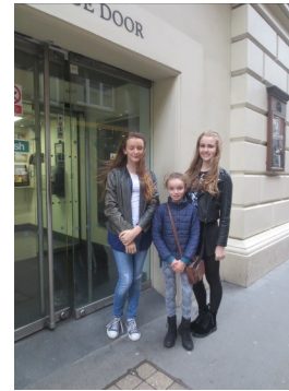
At the stage door