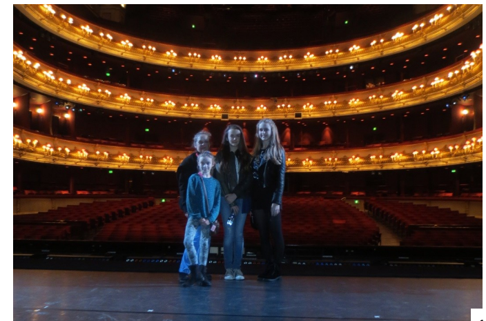
And finally on stage