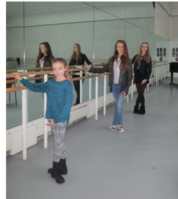
At the Barre