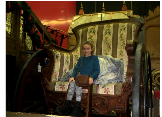
Sitting in Clara's chair from the Nutcracker